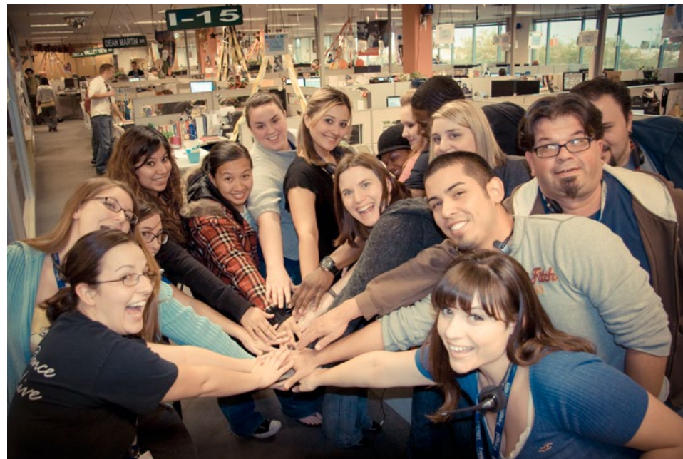
Customer service centre at Zappos